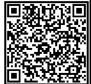
Holly Wise Chair

This WRAP certificate covers the facility with the address and production processes listed above. Please refer to the full audit report for details.