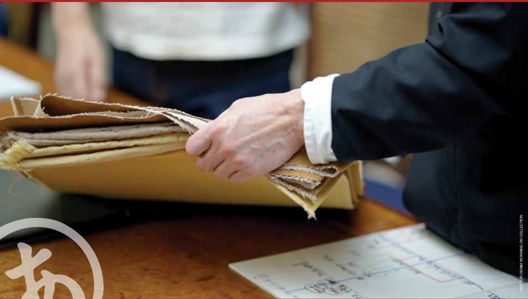
DOCTOR DENIM WORKING ON COLLECTION