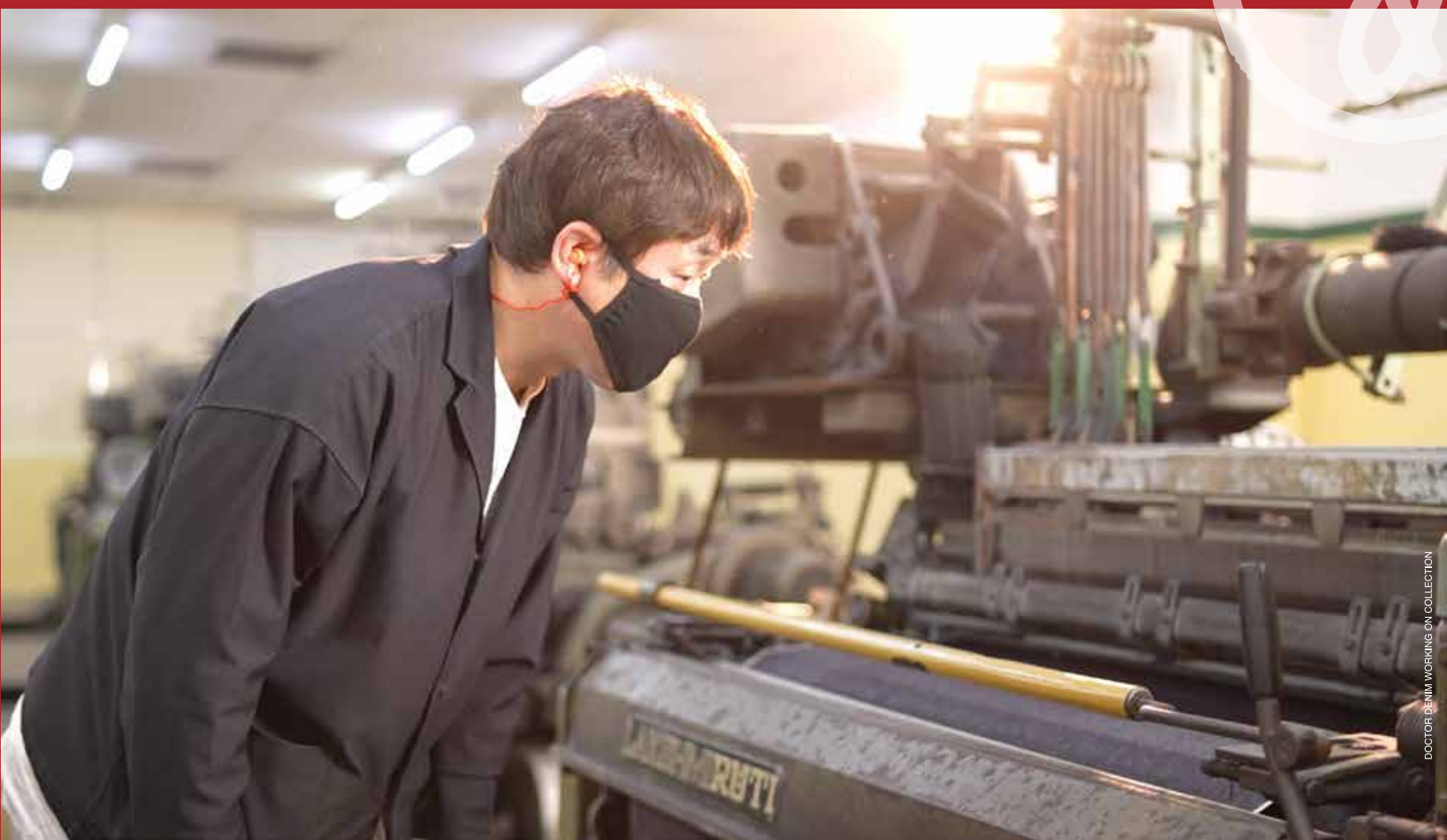
DOCTOR DENIM WORKING ON COLLECTION