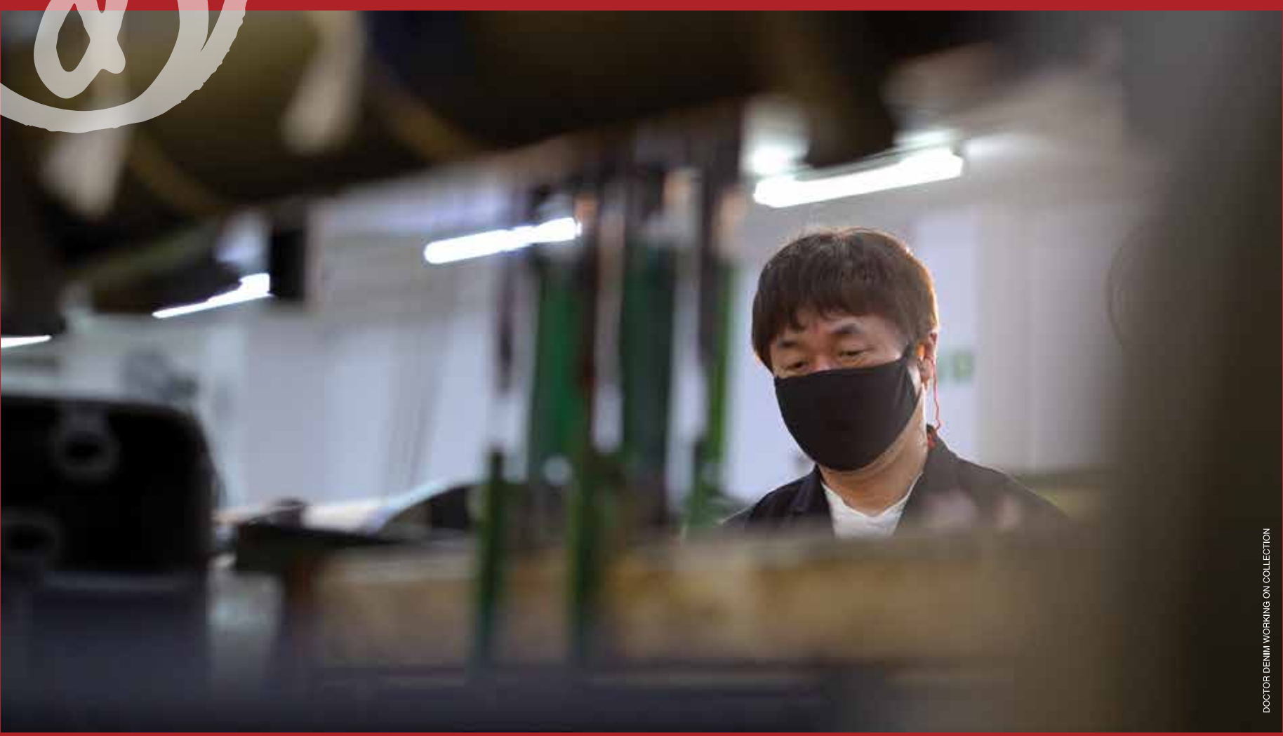
DOCTOR DENIM WORKING ON COLLECTION