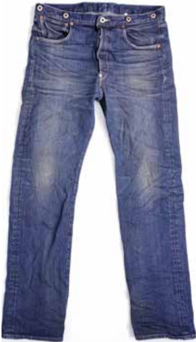
KYOTO - PSK STRETCH